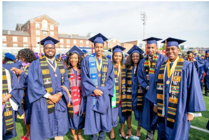
Proud Howard Prepared Social Workers!

Inabel Burns Lindsay Hall 601 Howard Place, N.W. Washington, D.C. 20059 (202) 806-7300 FALL 2025-SUMMER 2026