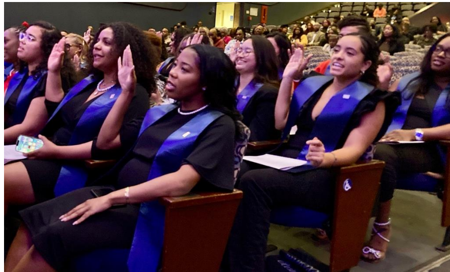
December 2023 Pinning Ceremony, Flagship and Starship Graduates Taking Alumni Oath

Inabel Burns Lindsay Hall 601 Howard Place, N.W. Washington, D.C. 20059 (202) 806-7300